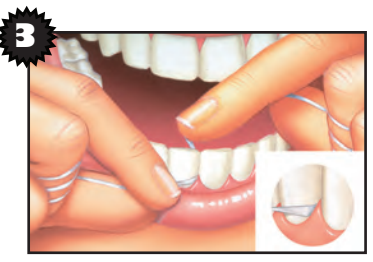
Slide floss up and down against the tooth surface and under the gumline. Floss each tooth thoroughly with a clean section of floss.