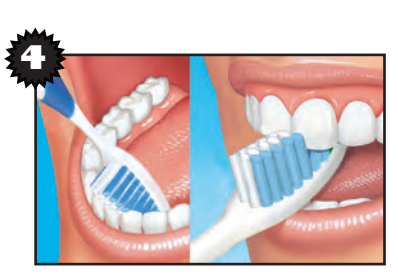
Tilt brush vertically behind the front teeth. Make several up & down strokes using the front half of the brush.